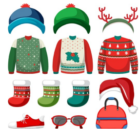
Santa's Workshop December 12