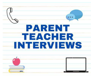
Parent/Teacher Interviews 3pm December 10